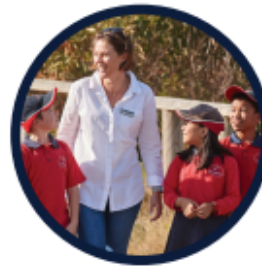
Build skills through fun